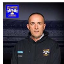
Apparel C/O Joe Zahra